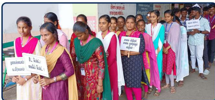
Road Safety Awareness Rally